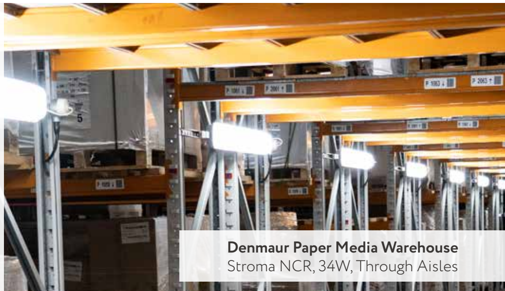
Denmaur Paper Media Warehouse Stroma NCR, 34W, Through Aisles